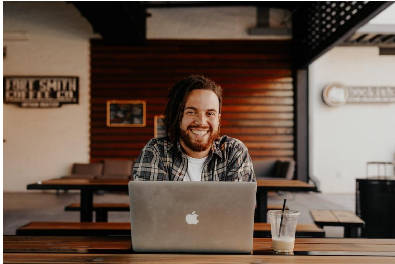
Meme: Smiling because I'm a successful penetration tester.