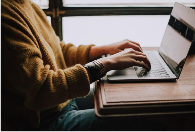
Meme: just me doing my daily duties of trying to save the world.