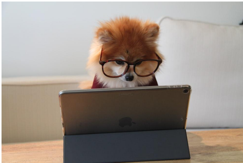
Meme: me looking at the cyber laws within the business and realizing there is a typing error.