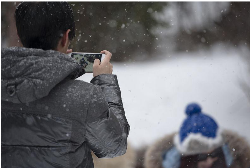
Meme: Wait, let me make sure I'm not connected to the public wifi.

These memes relate to human systems integration because it is showing how the memes kinda relate to how humans interact with technology.