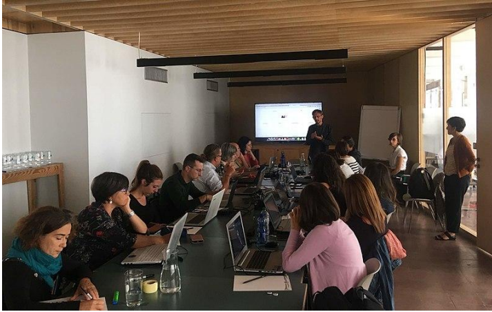
Meme: Wow, everyone looks so uninterested.