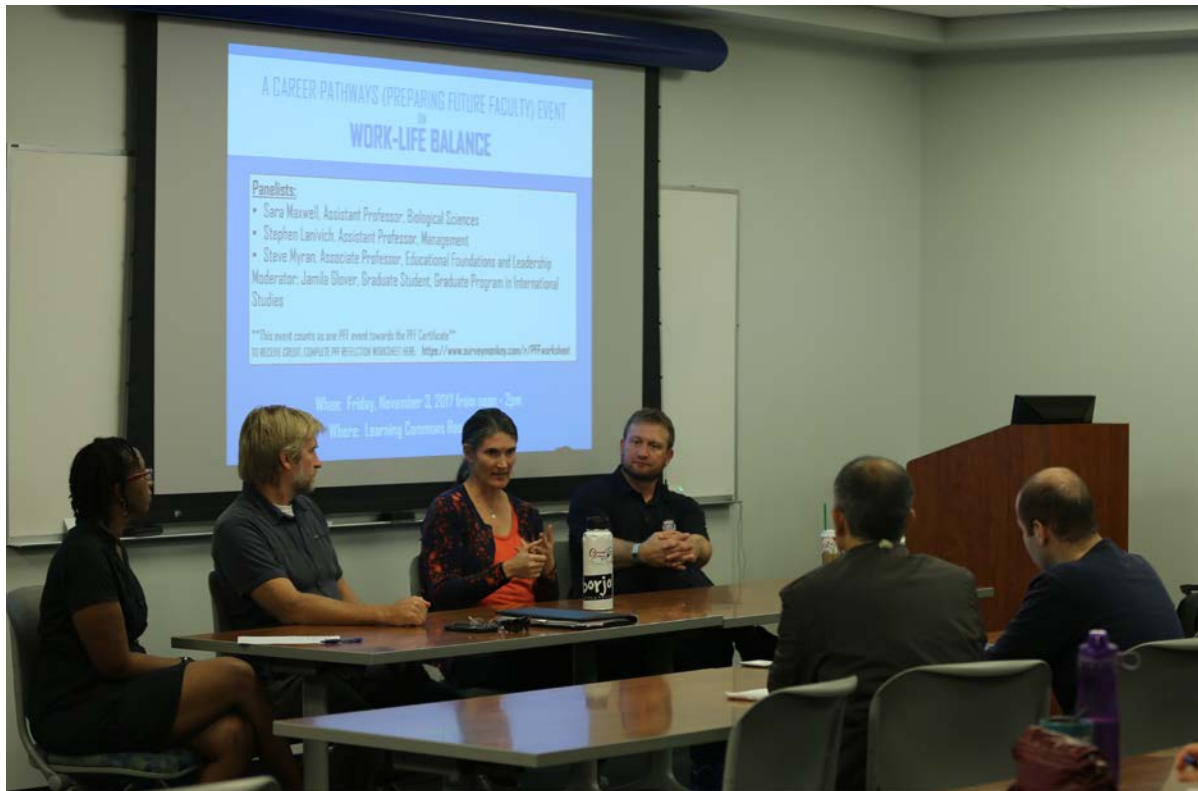
During the Work-Life Balance panel discussion, ODU graduate students received advice and tips on how to manage work-life balance.