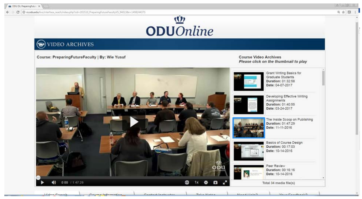
The video archive site can be accessed using MIDAS login.