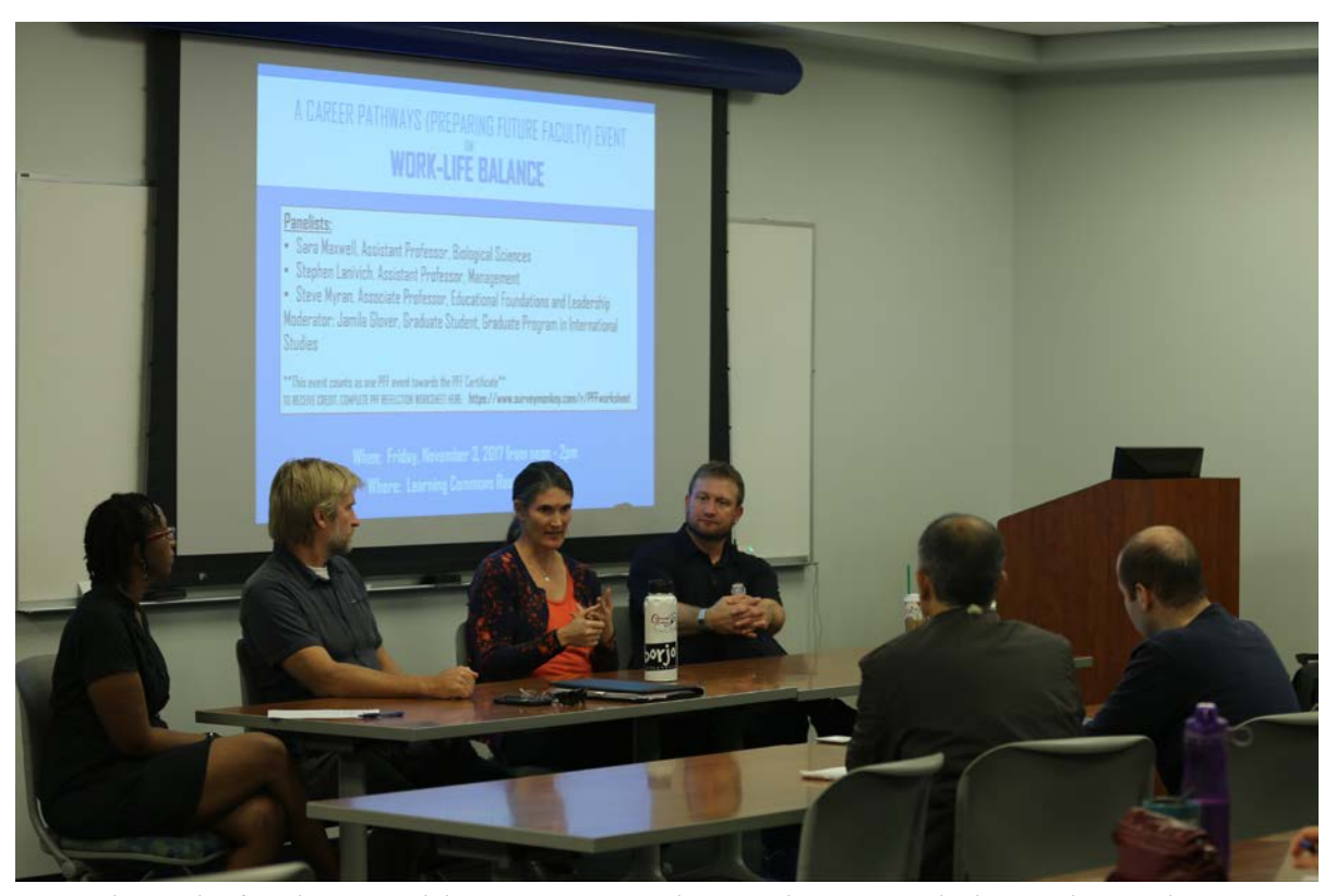
During the Work-Life Balance panel discussion, ODU graduate students received advice and tips on how to manage work-life balance.