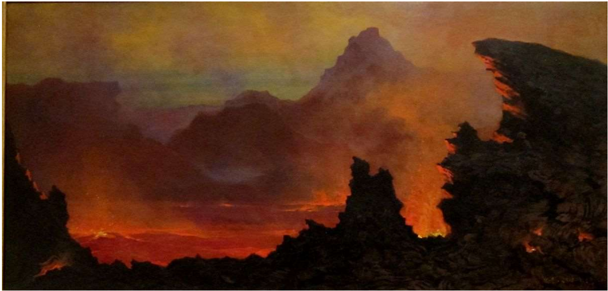
Jules Tavernier, Kilauea Caldera, Sandwich Islands, 1886, Oil on canvas, San Diego Museum of Art, https://artmuseum.princeton.edu/collections/objects/13332 (accessed June 28, 2021).

This representational piece I feel stands out in a positive way yet is able to still complement other pieces found in the museum. The warmer tones in the piece coincide with the other pieces that also used a warmer color scheme. However, it is able to stick out with its minimal use of vibrant shades of orange to depict the lava bringing your attention to the center of the piece. I also appreciate the use of blacks in the foreground on the rocks with the more vibrant oranges and reds sprinkled on the back giving a sense of mystery. Kind of makes you think about what else is happening behind the rock. I feel like a lot of the pieces at the museum shared this dark ominous and mysterious theme and really enjoy it. Also, the fact that a majority of the pieces I saw appeared to be representational.