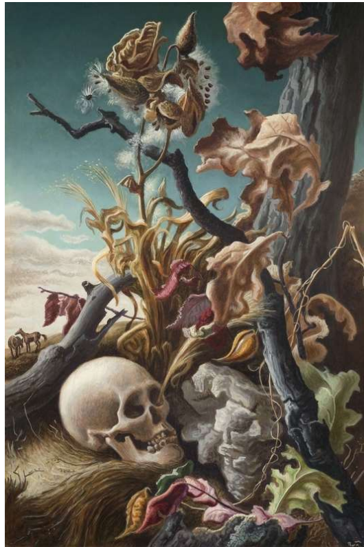
Thomas Hart Benton, After Many Days , 1940, Tempera and oil on canvas board, San Diego Museum of Art, https://www.sartle.com/artwork/after-many-days-thomas-hart-benton (accessed June 28, 2021).

For this piece depicting death and the passage of time I had a very positive reaction. This representational piece combines both warm and cool colors giving me an uneasy feeling of what is going on within the piece that I actually enjoy. Also, I enjoy its use of the skull as the main focal point. It draws your eye to the bottom center of the piece, then has your eyes follow the wilted plants and tree branch to the top left of the piece. I feel as if the negative space at the top left where the branch ends, gives the viewer a sense of emptiness and calm that I feel the artist intended. Another fact I found fascinating was the year this piece was created. It was made in 1940 at the beginning of World War II, when death and destruction was consuming the world. This piece does a good job of depicting the era of war that just begun.