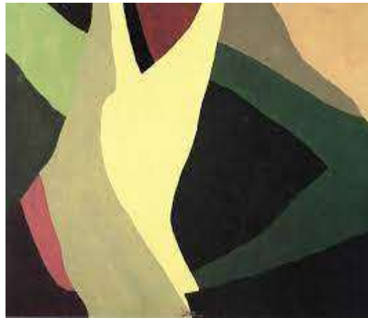
Arthur Garfield Dove, Formation I , 1943, Oil and wax emulsion on canvas, San Diego Museum of Art, https://www.flickr.com/photos/azkaged/24530848722/in/photostream/ (accessed June 28, 2021).

This abstract piece I felt really did not belong in the museum especially in the gallery it was located. It was labeled as an abstract piece, but I still see no resemblance to any real-world piece and would actually label it as non-representational. It was surrounded primarily by representational pieces with warmer tones while this piece had a brighter pascal color scheme. I know the image here does not appear how I am describing the piece, but from what I saw during the virtual tour the piece was a lot more vibrant and out of place. For instance, the yellow portions of the piece came off green, while the darker ones appeared bright green. This could be due to the lighting of the environment, but it still caught my attention of sticking out more in comparison to other pieces.