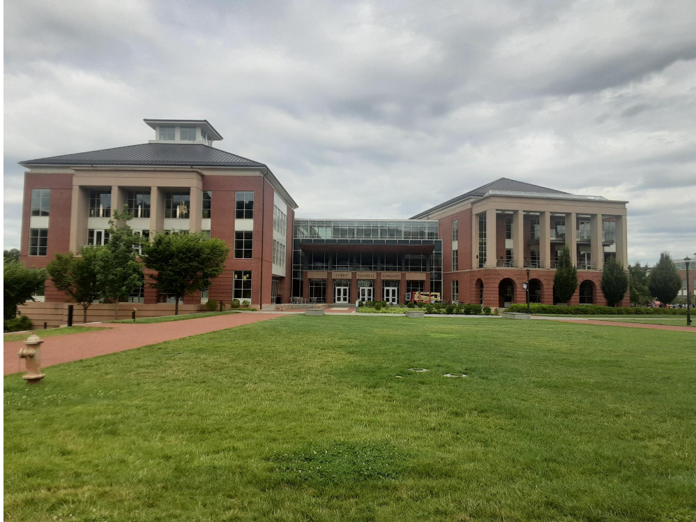
Jerry Falwell Library

pillars. The T floor is a quiet zone as well as the reading rooms and the group studies room on the third and fourth floors. There are at least three elevators which students, faculty, and staff can use.