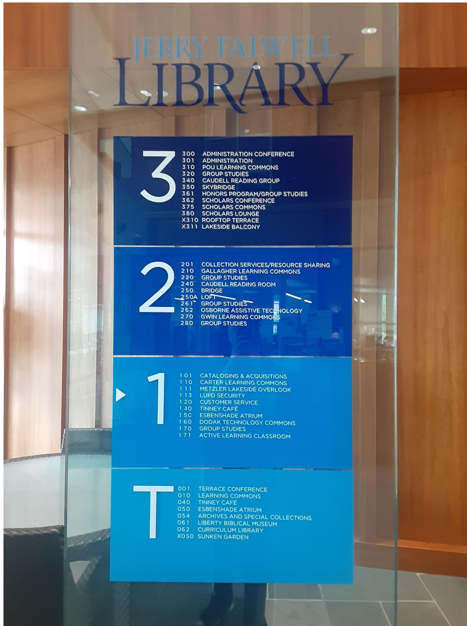
Jerry Falwell Library Sign (Jennifer Mays, 2022)

There are multiple resources available to the faculty, students, and public. The resources include books, magazines, audiobooks, DVDs, and games. There are also printers and copiers available. There are public computers available throughout the four floors of the library. There are also areas with televisions in which students can connect to their laptops and share their screens. On the main floor to the right of the entrance, the Dodak Technology Commons. There, patrons can have access to computers in which to do research, and assignments.