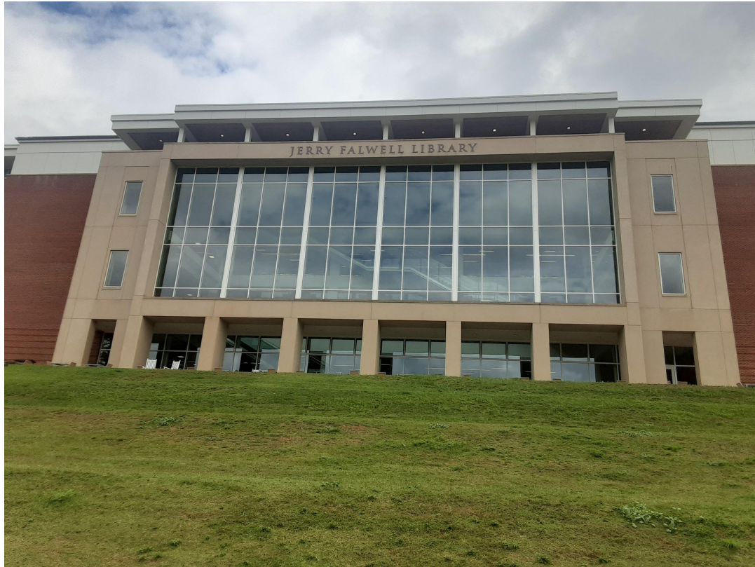
Falwell Library