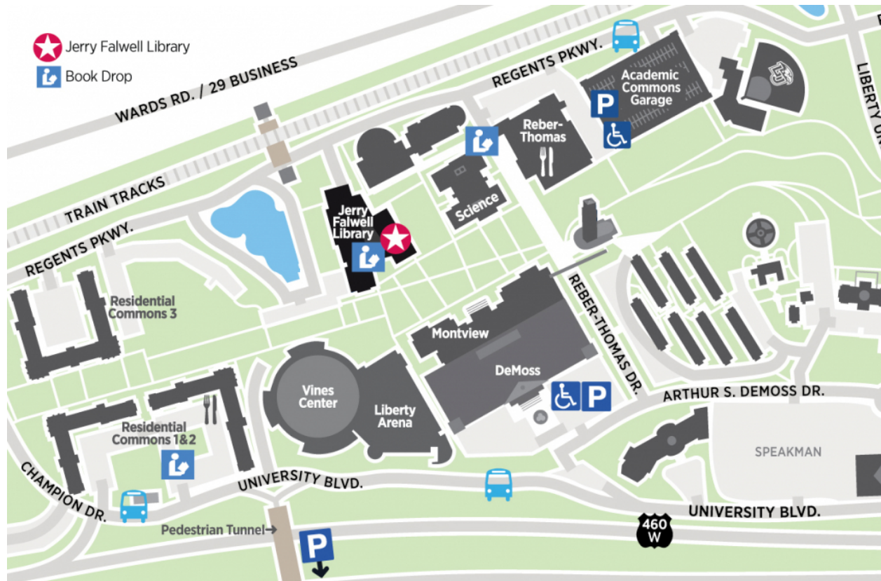
Liberty University Map (Google)

The Jerry Falwell Library is located at Liberty University campus. The library is a large building toward the back of campus. There is a small lake on one side of the library. The back of the library has the road Regents Parkway running past it and other academic buildings around it on the other sides (See the map below for reference). The Jerry Falwell Library consists of 4 floors. Each of the four floors consist of stacks of books, study areas for the students, public computers, and offices. There are signs listing the different areas on each of the floors in the library. The library is very modern and up to date. The spaces within the library are welcoming and open. There are patios, terraces, and desks in which patrons can relax and study.