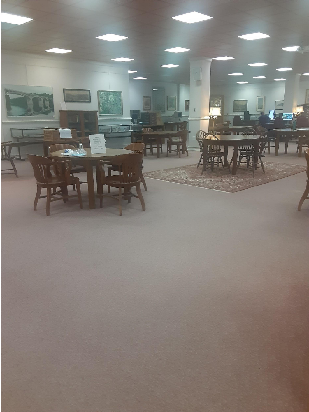
Study Area of Jones Memorial Library