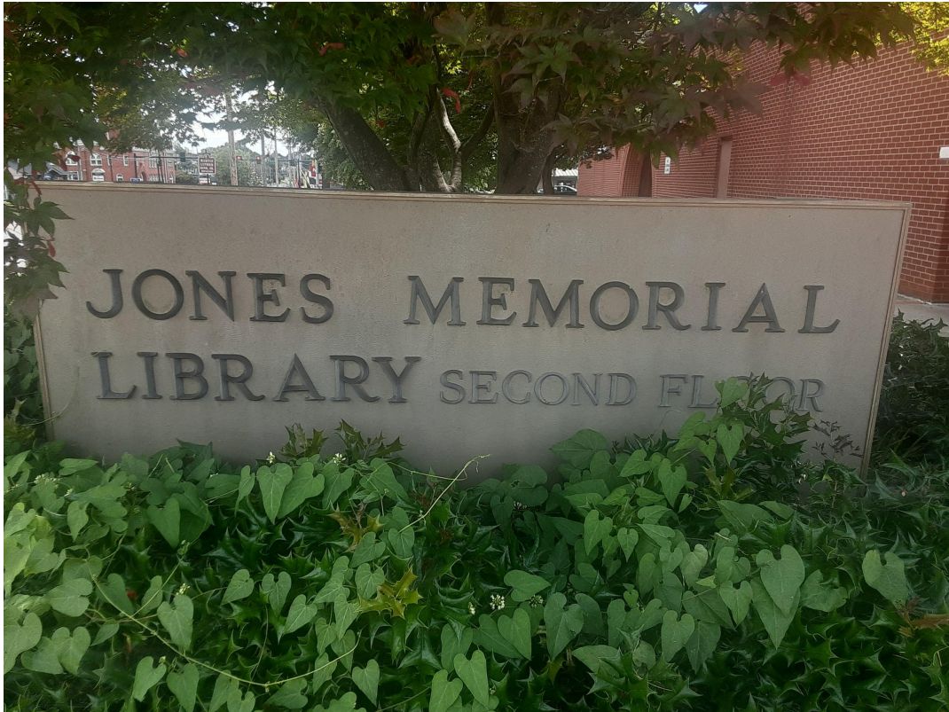
Sign outside of Jones Memorial Library