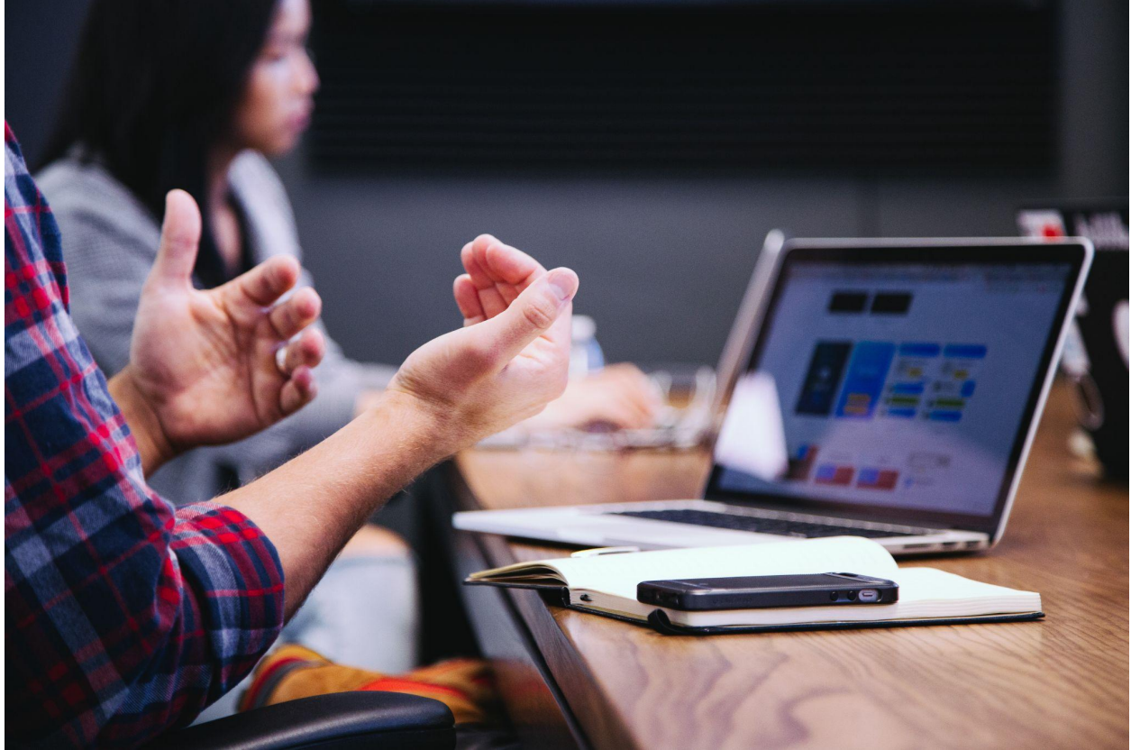
This person is conducting human factors engineering training with other employees.