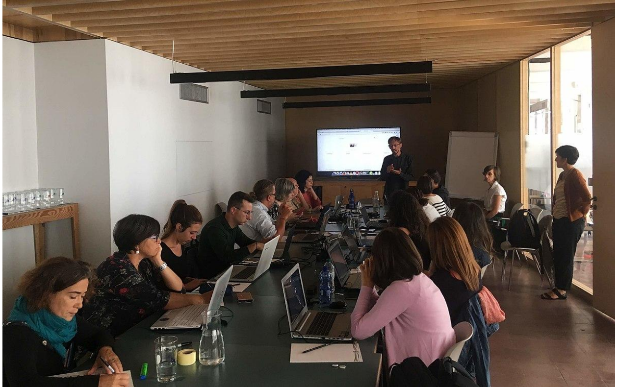
These employees are undergoing cyber security training to ensure that they are up to date with how cyber crimes can occur within a workplace.