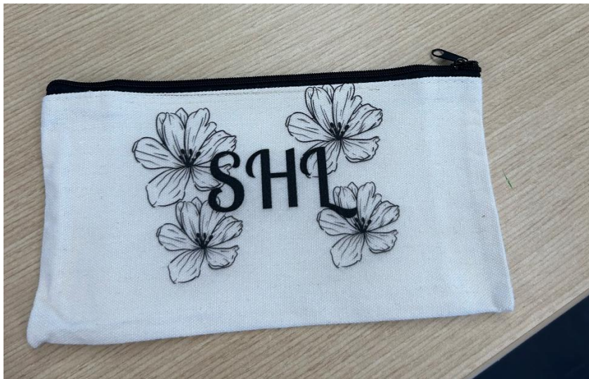
Pencil Case I created with DTG Printer.

Attached Below are some of the projects I worked on: