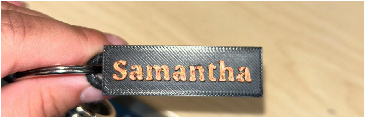
Keychain I created with the 3D printer.