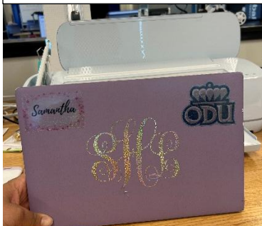
Stickers Made with Cricut